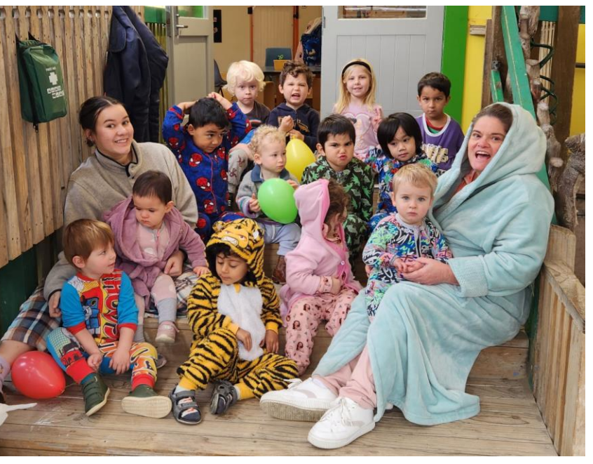
KEL Pyjama Day