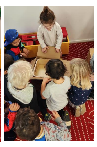
Unboxing our fantastic new stools